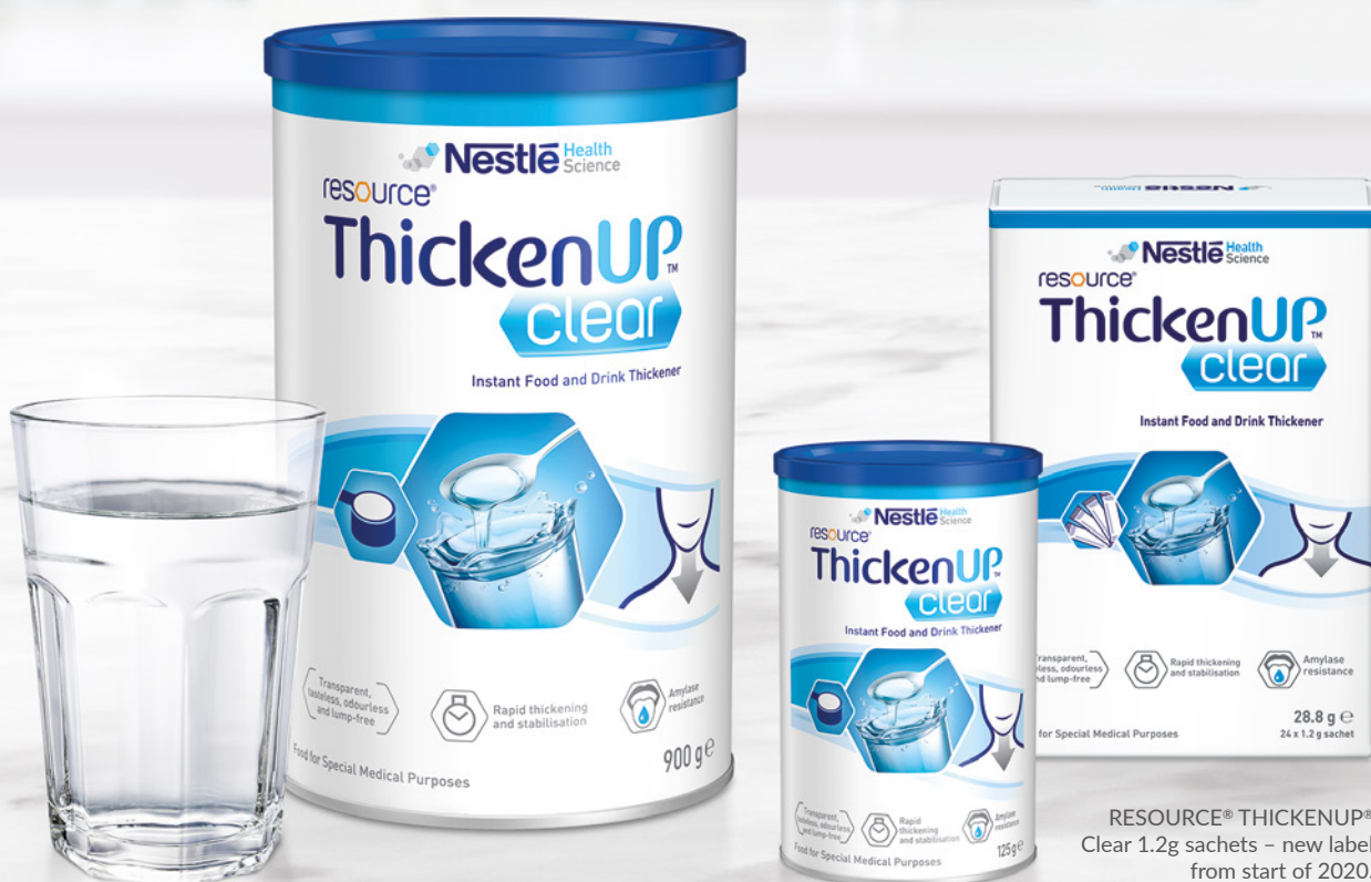
RESOURCE® THICKENUP® Clear 1.2g sachets – new label from start of 2020.

Ensuring ongoing patient safety under the new thickening standards.